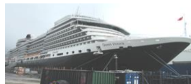
enormous as well as the 3 Cunard liners Queen Victoria Queen Mary2 and Queen