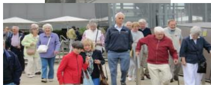
we were taken on a comprehensive and interesting tour around the cathedral with its many interesting features pointed out to us. We stopped off at the Pavilion End Pub for a lunch break. Unplanned visit to the interior of the Guildhall which provided some unexpected interest.

July saw us visiting Viridor Materials Recycling Centre. Fourteen recycled teenagers from the club met at the Viridor Materials Recycling Facility, at Ford for a private conducted tour of the facility. Unfortunately numbers were restricted to 14. After a very informative introductory talk by the Education Officer, we were issued with personal protection equipment and taken to the viewing platform where we could see what happens to the recycling material as it enters the plant before travelling on very fast moving conveyors to be machine sorted and separated into individual types and prepared for dispatch to reprocessors for manufacturing into new goods and products. Whilst on the viewing platform, we heard an excellent commentary through our individual head sets. A most informative visit.