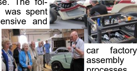
car factory, assembly processes

It started with a Visit to Malvern and the Morgan Car Factory in May . Sixteen members, partners and an Associate made their way independently to the Abbey Hotel in Great Malvern and gathered in a quiet private room for an excellent dinner and time to socialise. The following morning was spent on a comprehensive and very interesting conducted tour of the Morgan car factory, seeing all the