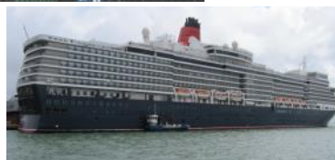
with its stifling heat and its brass levers and dials and the two hour cruise around the docks gave time to enjoy the sight of the enormous cargo ships the 3 Cunard liners Queen Victoria Queen Mary2 and Queen

between the showers. With sandwiches, sausage rolls and real ale for those who wanted it, our refreshments on board were enjoyed under cover and the SS Shieldhall with its volunteer crew brought us back to shore as the 3 liners were beginning their preparations for an evening sailing. All credit to our driver from Woods Travel who had to cope with torrential rain and flooded roads to bring us home safely.